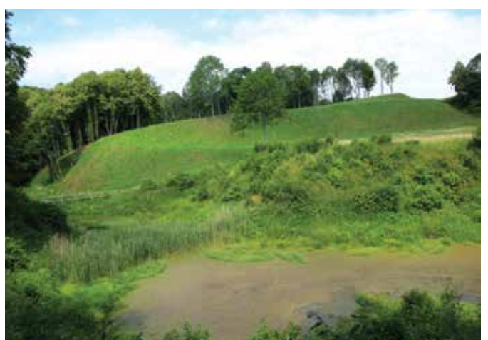
Opstainiai (Vilkyškių) I Mound