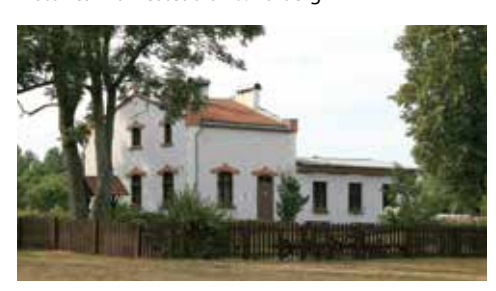
Martynas Jankus Museum in Bitėnai