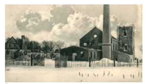
Šereiklaukis Manor Homestead after the World War I

We offer to observe nature and admire the landscape by hiking on the circular footpath in the Šereiklaukis forest. The trail starts at the fork of roads in Šereiklaukis village. There is an information stand describing the beginning and the end of the trail. It's not only one, but even three, trails of different lengths that start and end at the same point. Symbolically, they are named the yellow, green and blue tracks, with lengths of 1.5 km, 5.5 km and 9 km respectively. All tracks are marked with special signs to help you not to get lost. There are no artificial surfaces on the trail. In several places, the trail goes just through the forest, and the trail is marked with stripes on the trees, so be careful not to get lost from the trail. Foot-bridges have been installed in manor cemetery was built, planted with ash, the sections of the trail for crossing the wet places. By choosing the longest blue route,