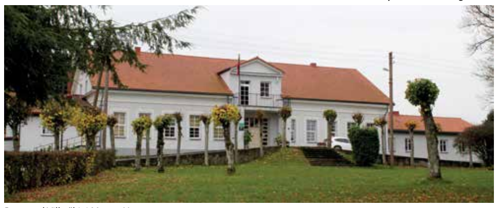
Restored Vilkyškiai Manor House