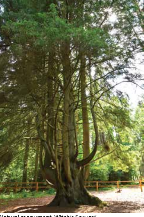
Natural monument "Witch's Spruce"