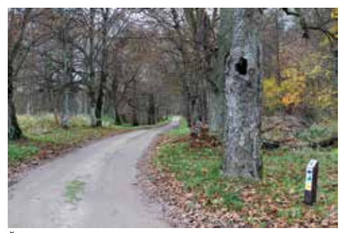
Šereiklaukis Forest Trail

Located in one of the largest meadows in Šereiklaukis forest, this tower was built for nature observation and natural landscape overview. Looking east, it offers a magnificent view of the natural meadow with terrain. In the distance you can see the chimney of the Šereiklaukis manor distillery, and a little to the Alley of Sereiklaukis Manor leading to Koplyčkalnis right on a sunny day you can clearly see the place where the Šešupė and the Nemunas merge. This observation place is located on the Šereiklaukis Forest Trail