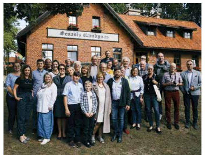
Meeting of the "South Baltic Manors" project partners in Rambynas Regional Park, September 2019.

One of the initiated Interreg projects "South Baltic Manors" has discovered the rich and unique heritage of manors in the