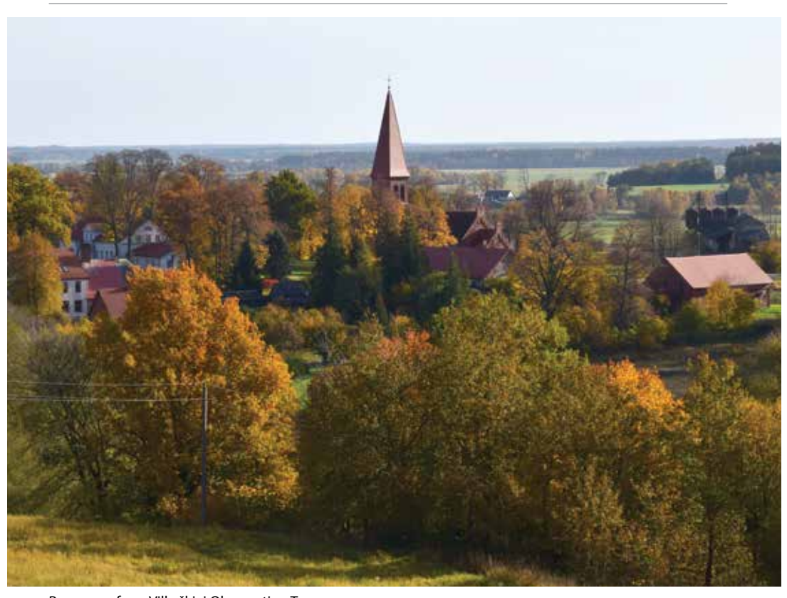
Panorama from Vilkyškiai Observation Tower