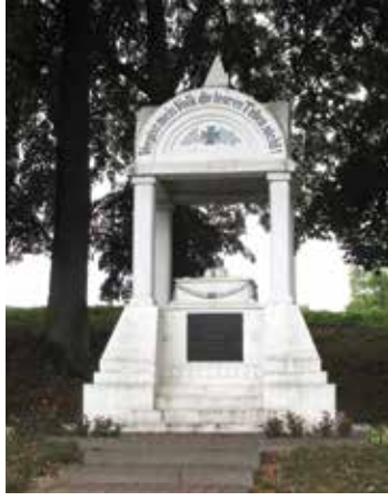
Monument to the folks of Vilkyškiai who died during the World War I