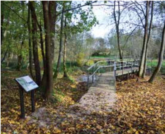
Cognitive trail, based on the motifs of Ulla Lachauer's book "Paradise Path"

It is located in a narrow strip between Lake Merguva and the gravel road winding through the bend of the Ragainė bend, about 2 km from the Bitėnai resort. From here there is a great view of the Merguva oxbow lake, the meadows of the Ragainė bend, and the town of Ragainė on the other side of the Nemunas. It clearly shows the tall tower of the pulp factory and the ruins of the brick Ragainė castle built by the Crusaders at the beginning of the XV century. Lake Merguva lies to the south of Bitėnai village, almost parallel to the Nemunas, and only connects with it at the northern end. Once, the Nemunas flowed along the Šereiklaukis forest, but, touching the loop, gradually moved towards Ragainė. A flat, sandy plain formed full of elongated "eyes" of oxbow lakes formed between the forest growing in the highlands and the riverbed. Lake Merguva is the largest one.