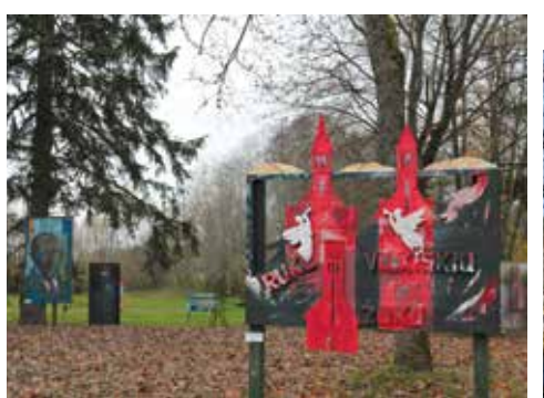
Garden of Paintings of Lithuania Minor by the M. Jankus Museum