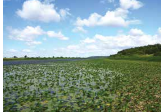
Panorama from the observation tower by Lake Merguva

View of Ragainė Castle on the other side of the Nemunas from the observation tower by Lake Merguva