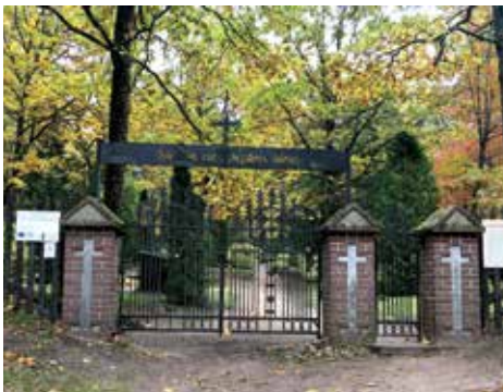
Bitėnai - Užbičiai Cemetery - Pantheon of Lithuania Minor