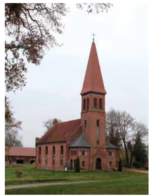
Vilkyškiai Evangelical Lutheran Church

is surrounded with legends. It is probably the only ordinary spruce of such an impressive, unusual shape not only in Lithuania, but also in Europe or in the whole area of self-distribution of these trees. There is a convenient access path and an observation deck for visiting. The tree is fenced, protecting it from unwanted root trampling in the foothills.