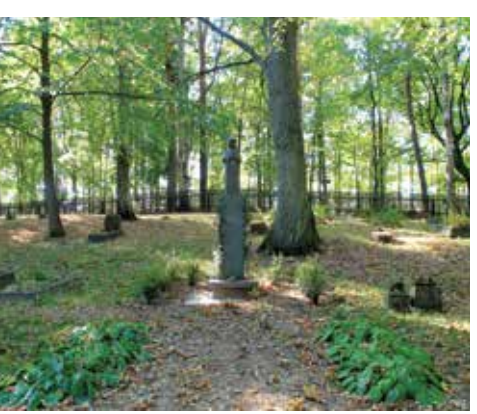
Bitėnai - Šilėnai Cemetery