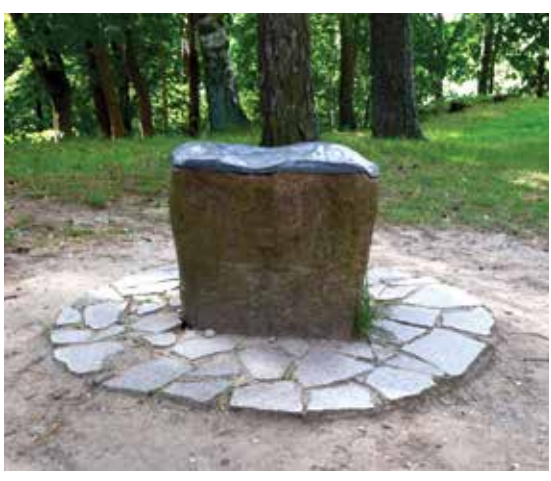
Historic stone on Rambynas Hill