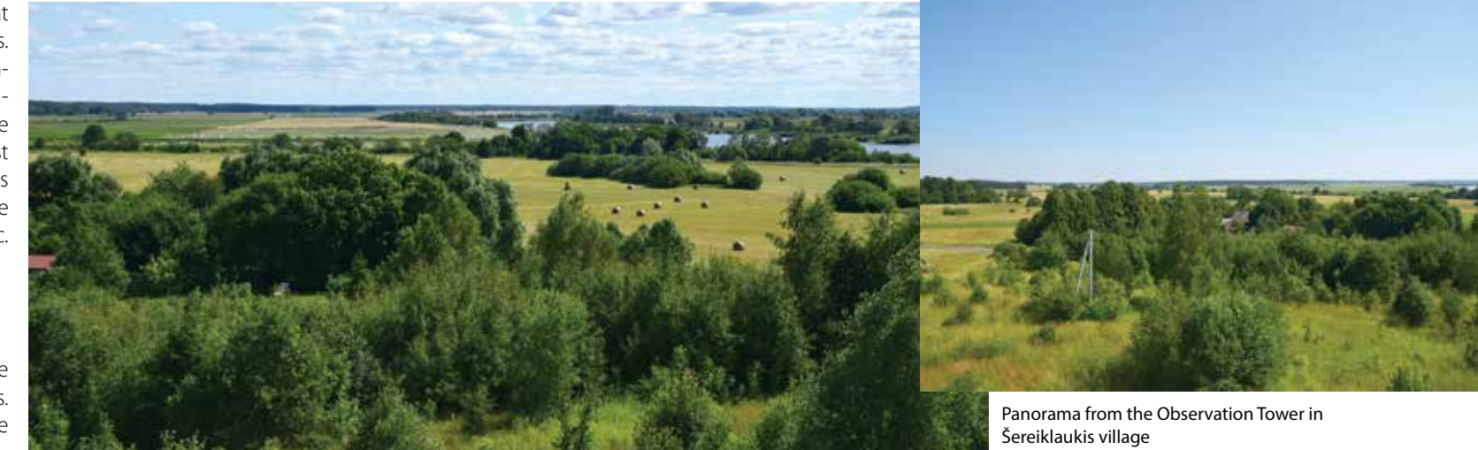
Šereiklaukis II Mound (Giant's Grave)