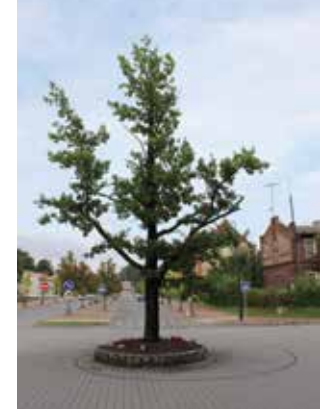
"Vilnius Oak" in Pagėgiai, 2018.

Traveling from Klaipeda to Rambynas, you can visit the museum located in Šilutė Hugo Scheu Manor. Hugo Scheu was a well-known figure in East Prussian economy