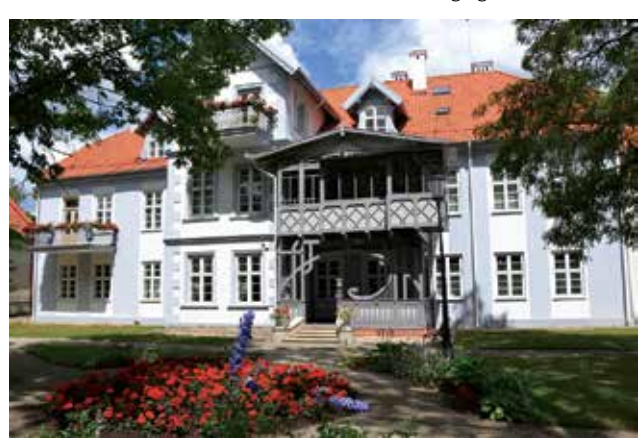
Hugo Scheu Manor - Museum in Šilutė. www.silutesmuziejus.lt

As you approach Rambytown of Pagėgiai, famous for