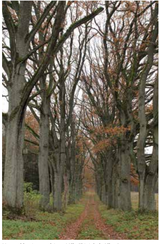
Natural heritage object "Vilkyškiai Oak Alley"

On the outskirts of the central part of Vilkyškiai town, there is a monument in memory of the parish men who died in World War I. The monument was built in 1920. The granite slabs in the niches of the monument with the names of the dead were broken during the Soviet era. In 2002 the monument was restored, but the names of the dead have not been established. The inscription on the monument: "In memory of those killed in wars, in exile and far from the Homeland. Vilkyškiai Church Community".